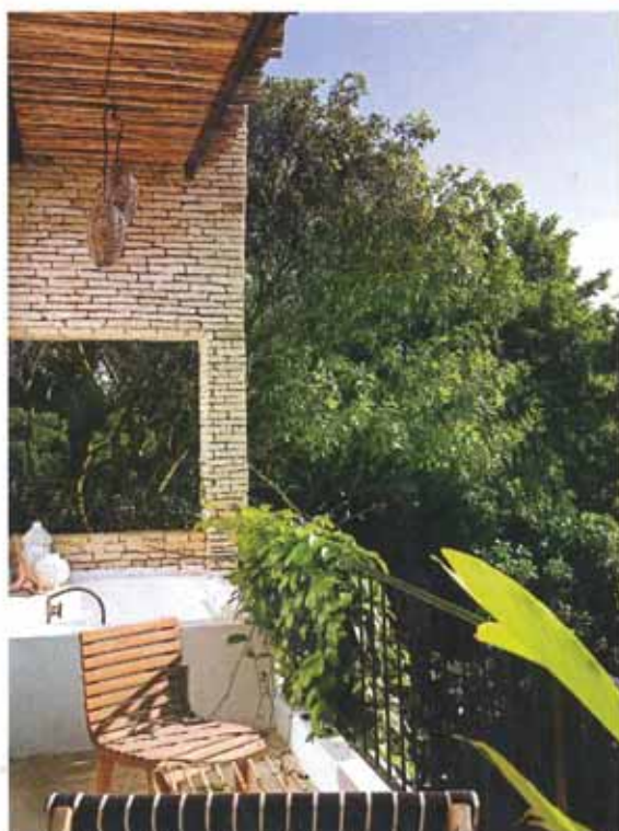
CLOCKWISE FROM TOP La Semilla's Cuartos Terraza has a queen-size bed, sitting area and terrace; the welcoming hotel lobby;